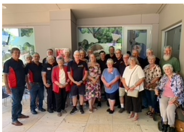
Central Victoria Group Photo