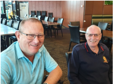
Some very happy faces at the Metro - West lunch held on Friday 2nd September at the Kealba Hotel