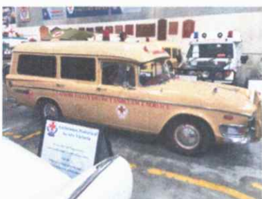
A new addition to the Ambulance Museum - A Humber Ambulance