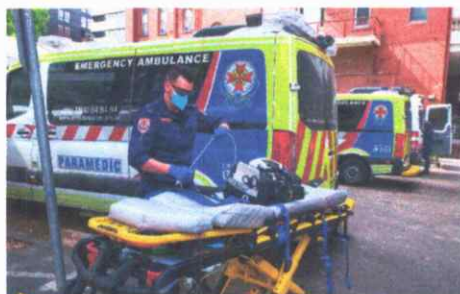
A paramedic moving equipment outside St. Vincent's Hospital in Melbourne

"More than one-in-five calls to triple zero for an ambulance do not need an emergency ambulance response, and we ask the community to please save triple zero for emergencies and to use Nurse on Call where appropriate."