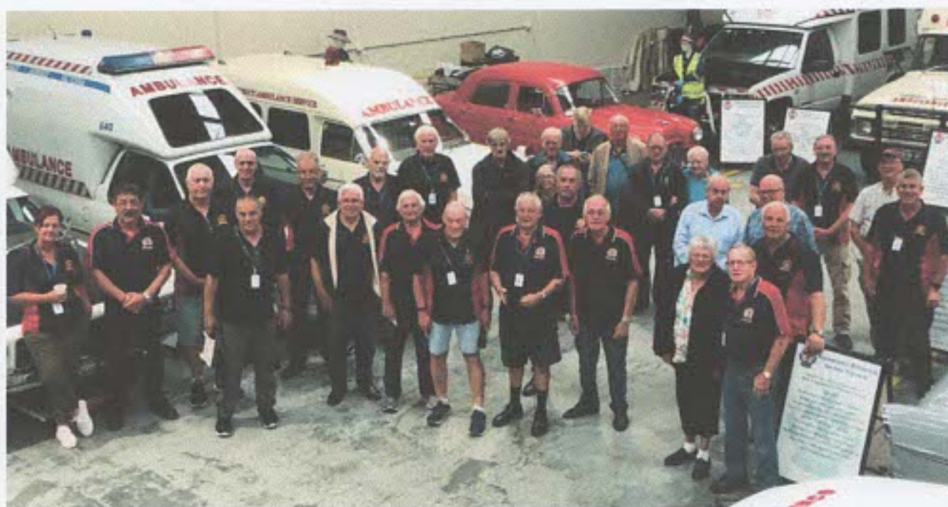
Members at the AGM - 29th January 2021