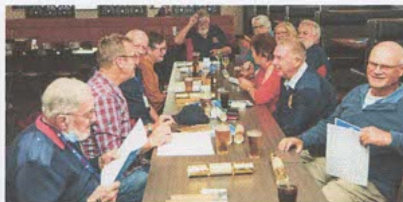
South West Victoria Members enjoying lunch on Monday 7th December