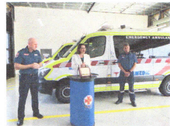
The new Diamond Creek Branch opening on the 5th April 2019