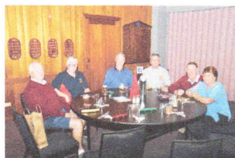
Warrnambool Members lunch December 2018

Our next get together is 5 th June, breaking the usual time sequence due to Committee having their G.M. on the 12 th . This change ensures a worthy Branch visit to us from a member of Committee.