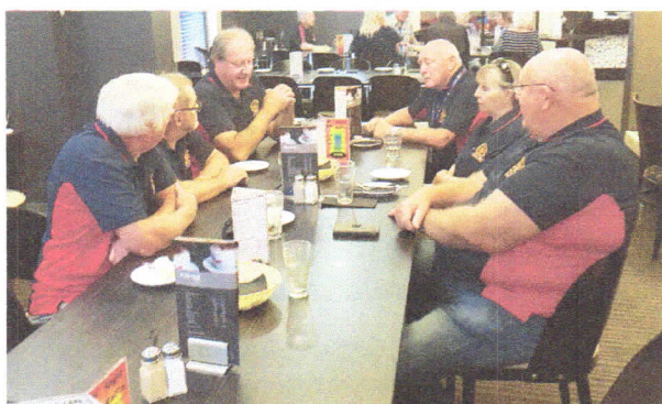
Mildura Members enjoying lunch at the Mildura RSL - February 2019