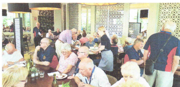
Central and Norther Victoria Members at Bendigo RSL - February 2019