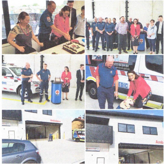
Opening of the new Preston Branch on the 17th March 2019