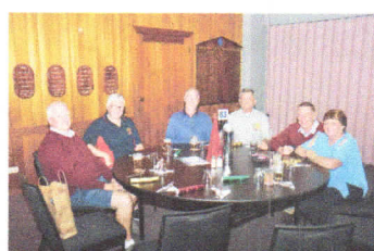
South West Members Lunch December 2018