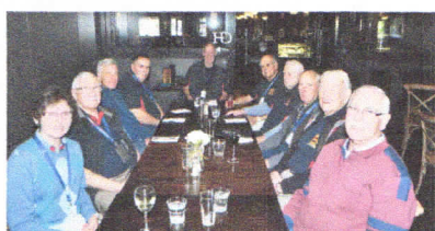
Ballarat Member lunch - November 2018