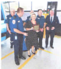
Hoppers Crossing & MICA 23