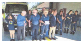
Belgrave Branch Opening. Left & Right