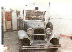
One of the many old Ambulances at the Museum