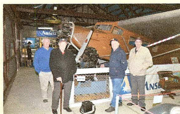
Two more photos from the