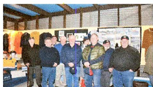
South West District Members at the Ansett Museum