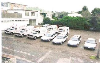
Warrnambool Ambulance Fleet 1994

Phone: 03 8503 7745 Mobile: 0435 010 943 E-mail: raav.secretary@gmail.com