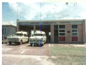
Ararat Ambulance Station Unknown year