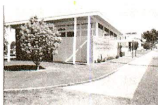
Wimmera District Headquarters ? 1980's