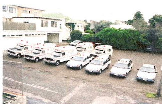
Warrnambool Ambulance Fleet 1994

Phone: 03 8503 7745 Mobile: 0435 010 943 E-mail: raav.secretary@gmail.com