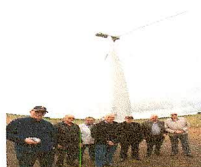
South West Group Members at the Wind Farm