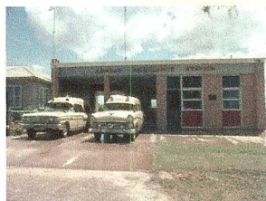
Ararat Ambulance Station Unknown year