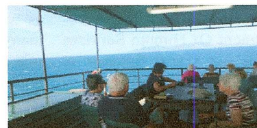
The covered deck area

Passengers were able to go upstairs to a small covered deck area. There was a choice of magazines to read, videos to watch, play cards, chat or just do 'nothing' and relax and enjoy the beautiful scenery.