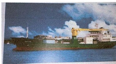
The M V Trinity Bay"

Tuesday, 21 April our 'adventure' began, when we met, with other passengers, at the Cairns wharf to board 'The M.V. Trinity Bay' – a cargo vessel – for a 5-day round trip from Cairns to the 'top of Australia' – this vessel is owned and operated by Sea Swift Pty Ltd., who have a very informative website.