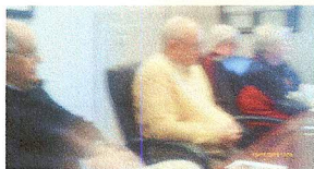
Some of our Geelong & Surf Coast Members at their July Meeting