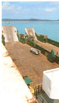
View of Thursday Island

Following Horn Island we sailed across to Thursday Island. The local name for this island is 'Walbein' meaning waterless. Water for Thursday Island is now piped across from a reservoir on Horn Island.