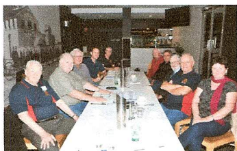
S W Members at their June meeting in Warrnambool