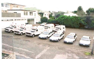
Warrnambool Ambulance Fleet 1994

Phone: 03 8503 7745 Mobile: 0435 010 943 E-mail: raav.secretary@gmail.com