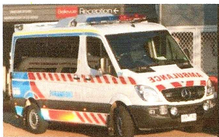
Current style General Purpose Ambulance Mercedes Benz Sprinter

Check us out at www.retiredambulancevictoria.org.au