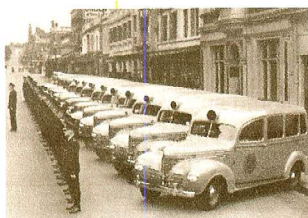
Line up outside Lonsdale St HQ Can't see that happening outside an Ambulance Station today