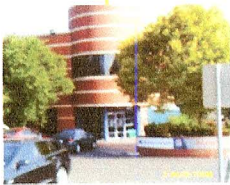
AV Headquarters Doncaster