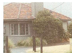
Brighton Ambulance Station in Nepean Highway Brighton East