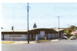
The Warrnambool Ambulance Station