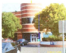
A V Headquarters Doncaster