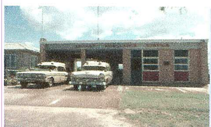
Ararat Ambulance Station Circa 1960's