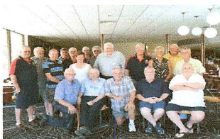
Some of our North East Members enjoying their gathering at Benalla