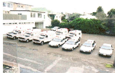
Warnambool Ambulance Fleet - 1994

Finally we are still interested in gauging if we should make the banking change to Bendigo & Adelaide Bank. The support so offered would be of assistance and will allow us to keep our Membership Fees as low as we can. Do you have an opinion on this issue? Let us know at the AGM.