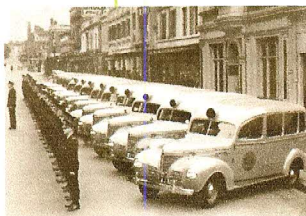
Line up outside Lonsdale St HQ Can't see that happening outside an Ambulance Station today