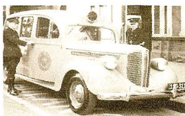
? 1950's Ambulance and Crew outside Lonsdale Street Headquarters

Your Committee looks forward to having these documents delivered within the next 2 to 3 weeks in order to satisfy the 21 day Notice of Change required by the current Constitution.