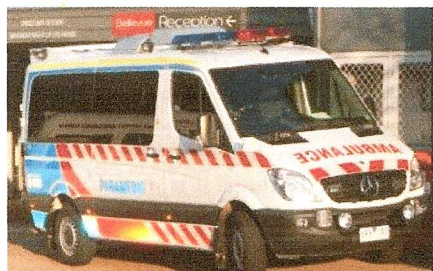
Current style General Purpose Ambulance Mercedes Benz Sprinter

Check us out at www.retiredambulancevictoria.org.au