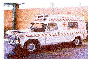
Car 842 - PAS MICA